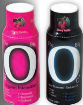
2 Ounce Plastic Bottles