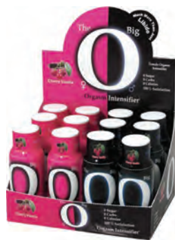
12 Bottles Per Display Box