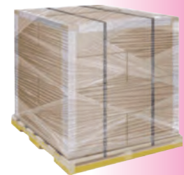
36 Master Cases Per Pallet (5184 units)