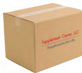
Master Case Contains 12 Display Boxes (144 units)